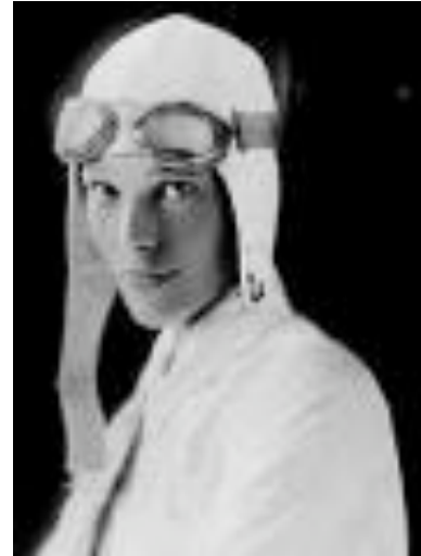
Photo: Amelia Earhart, renowned aviatrix and member of the Zonta Club of New York. Since 1938, Zonta International has given over US $5 million in scholarships to over 1,000 women in postgraduate aeronautical and engineering studies.

2000 - 2002: Elimination of maternal and neonatal tetanus in Nepal, the eradication of violence against women and children in India, the elimination of female trafficking in Bosnia-Herzegovina