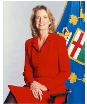
Photo: Hilary Weston, former Lieutenant Governor of Ontario and honorary member of the Zonta Club of Toronto.